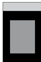
357023-- Facility View 10.4" PNG sign interactive with tactile header panel 252 x 56 mm 252 mm 388 mm